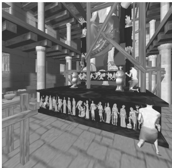
Figure 5: Image from Feidias' Workshop where most of the techniques described are visible.

We chose to incorporate characters depicting workers and Feidias, the sculptor himself, using IBR in the form of animated impostors. This technique was chosen because of its low polygon count since the detail of the models in the scene was high. The models and some animations were created using Curious Labs POSER ® and Discreet 3Dstudio Max ® in a fraction of the time compared to morph target 3D models we created for full 3D character animations in previous projects. The texture sizes used was 128x256 and 256x256 depending on the pose of the character. Despite this being a very low texture size, because of the blending and antialiasing techniques used to create the final images, the impostors looked quite satisfying even from up close.