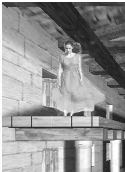
Figure 2: A Video source (girl) is superimposed as a billboard in the scene. The partial silhouette haloing is a result of the chroma-keyed transparent cloth and hair.

This technique was originally applicable to low-level immediate OpenGL ® rendering, but the idea was ported to a scene-graph-based environment, based on OpenGL Performer ™ . The original video is post processed to fit a power-of-two size, as the video source is used as a texture. Using chroma-selection, an inverted masking video is produced and saved in a separate video file. In each frame draw call, a time-synchronised frame is loaded from the buffer of both channels (mask and image) and placed on an identical piece of geometry. In the case of our VR engine, a billboard was adopted as the underlying geometry (Figure 2), as the original use scenario demanded an image of a real actor always moving in front of the user, in a guided tour.